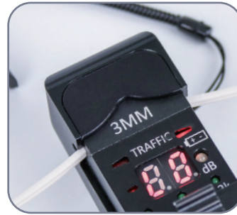
FTTH Drop cable