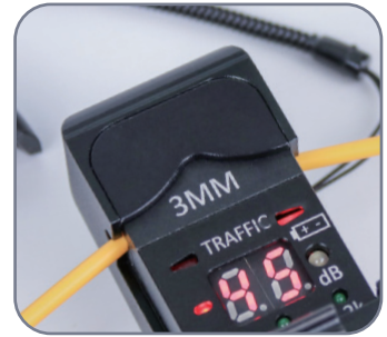
3.0mm jump cable