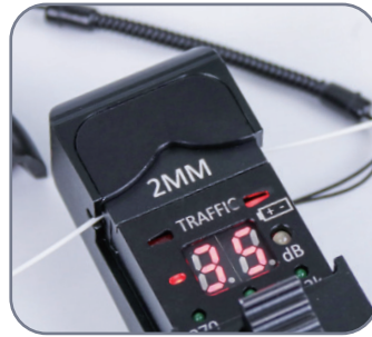
0.9mm fiber cable