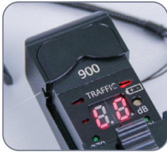
Bare fiber cable