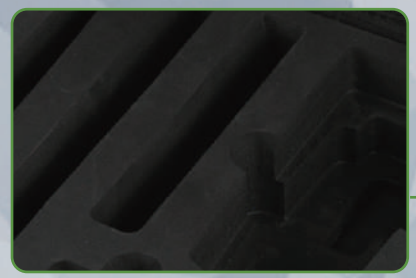
The internal anti–collision design uses high–density sponge to isolate and protect tools.

Plastic handle, Ergonomic design arc, keep your hands comfortable.