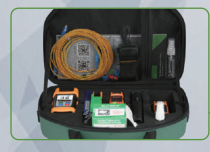
Large internal capacity, complete product configuration.