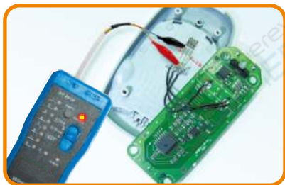
test positive and negative pole of DC electric level

Push DIP switch on emitter to position of “SCAN” , press function switchover button on emitter for 2 seconds, “STATUS” indicator will turn off and “VERIFY” indicator flashes, insert the crystal plug of crocodile clamp into RJ11, clamp the two ends of cable with crocodile clamps, in case that “STATUS” indicator lights up in red , it means the end clamped by red clamp is positive pole, in case that “STATUS” indicator lights up in green, it means the end clamped by red clamp is negative pole, electric level can be judged by brightness of the status indicators; the lighter the indicator, the higher the level is; the darker, the lower.