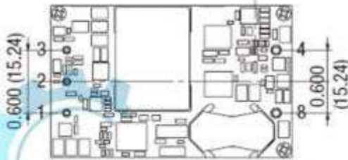
PIN SIDE VIEW