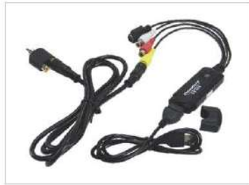
AV转USB转换器 AV-USB image box