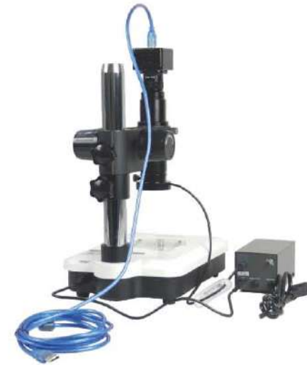
SK2500U接线图 (Wiring diagram)