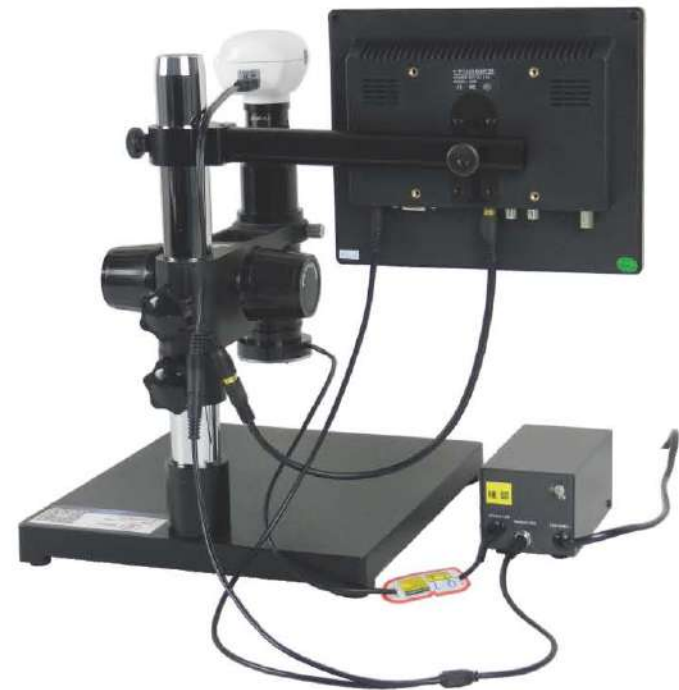
SK2700H3接线图 (Wiring diagram)