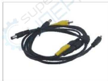
USB尾线+信号线+一分二电源线 USB Tail line+Signal line +One point two Power line