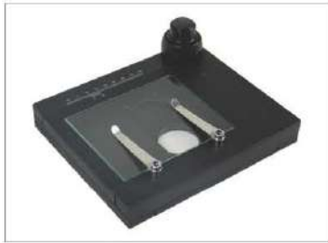
移动平台 Mobile platform