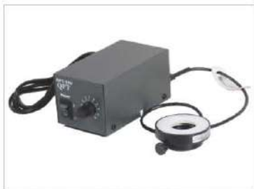
12V固定+可调电源控制器+环形灯头 power control box