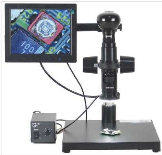
SK2700H2 Microscope host SK2700H2

打开包装，可看到以下标准附件： 主机，8寸屏，12V固定+可调电源控制器+环形灯头，USB尾线+信号线+一分二电源线，用户手册。 After the unpacking, you will see the following standard accessories: Microscope host, power control box+ring light, USB Tail line+Signal line +One point two Power line, User manual.