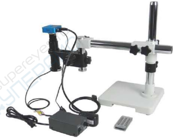
SK-T1(HDMI-T2)接线图 (Wiring diagram)