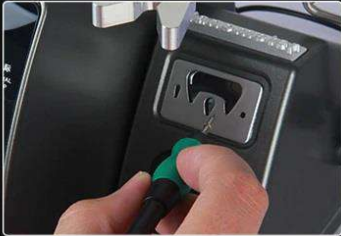
1. No need to wait for the high temperature to drop to replace the soldering iron tip

The built-in soldering iron rack can be stored and placed to facilitate quick replacement of soldering iron tips with different needs.