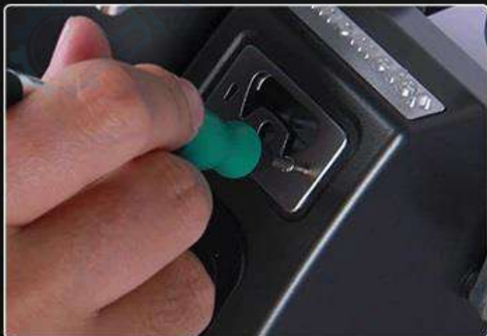
5. Directly use the handle to align the tip of the soldering iron and click to go