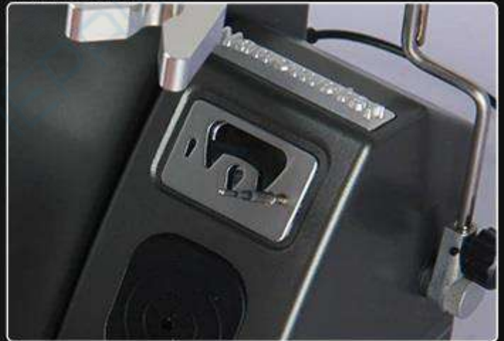
4. The soldering iron tip that needs to be replaced is placed in the opposite hole position