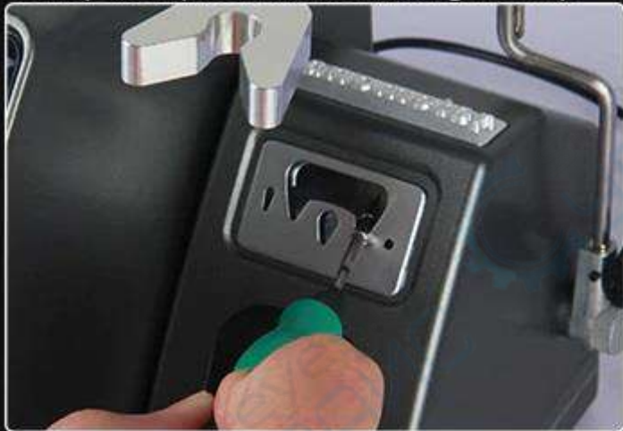
3. After stuck, pull out the soldering iron tip