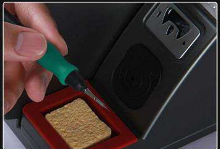
6. Can be used directly after replacement