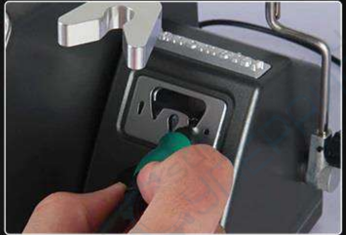
2. Align the bayonet of the soldering iron holder