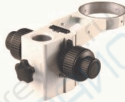
A6 Coarse & Fine Focusing Mount ID.32mm for Pole ID.76mm for Microscope Body Dist. Centre-to-centre:155mm The Vertical W.D.:45mm The Precision:0.002mm