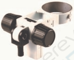
A3 Focusing Mount Mounting Dia.16mm ID.76mm for Microscope Body The Vertical W.D.:50mm