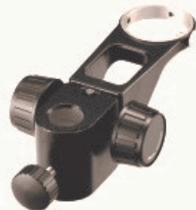
XDZ-A1 Focusing Mount ID.25mm for Pole ID.50mm for Microscope Body Dist. Centre-to-centre:140mm The Vertical W.D.:62mm