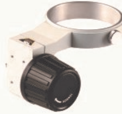
A5 Focusing Mount ID.76mm for Microscope Body The Vertical W.D.:47mm