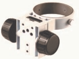
A4 Focusing Mount ID.76mm for Microscope Body The Vertical W.D.:45mm