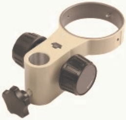
A2 Focusing Mount ID.24.5mm for Pole ID.76mm for Microscope Body The Vertical W.D.:50mm