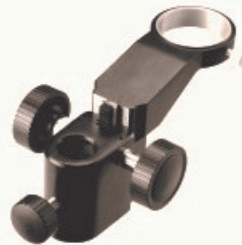
XLB-A1 Focusing Mount ID.25mm for Pole ID.50mm for Microscope Body Dist. Centre-to-centre:140mm The Vertical W.D.:42mm