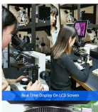
Real Time Display On LCD Screen