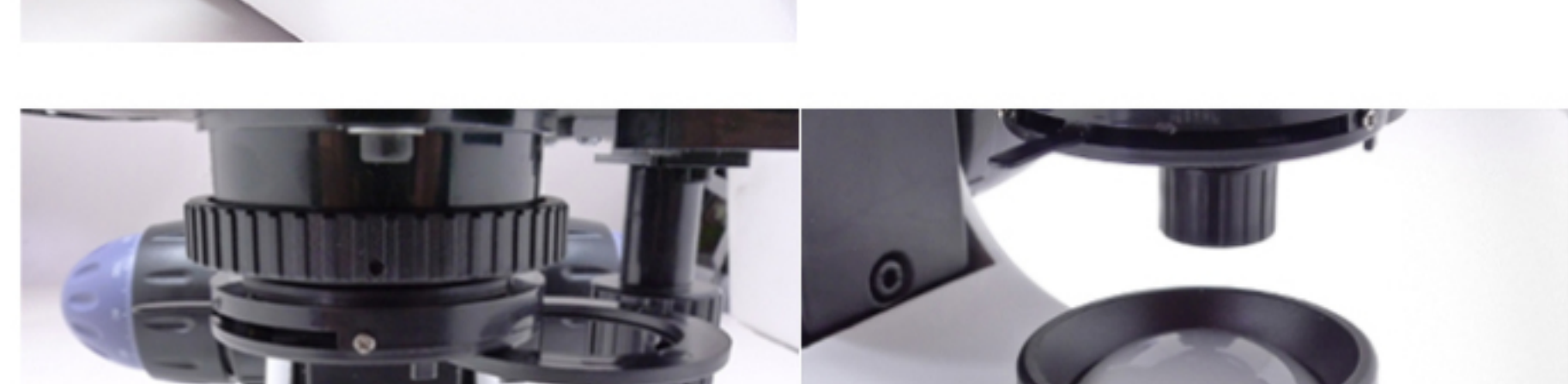
Light Source Collector