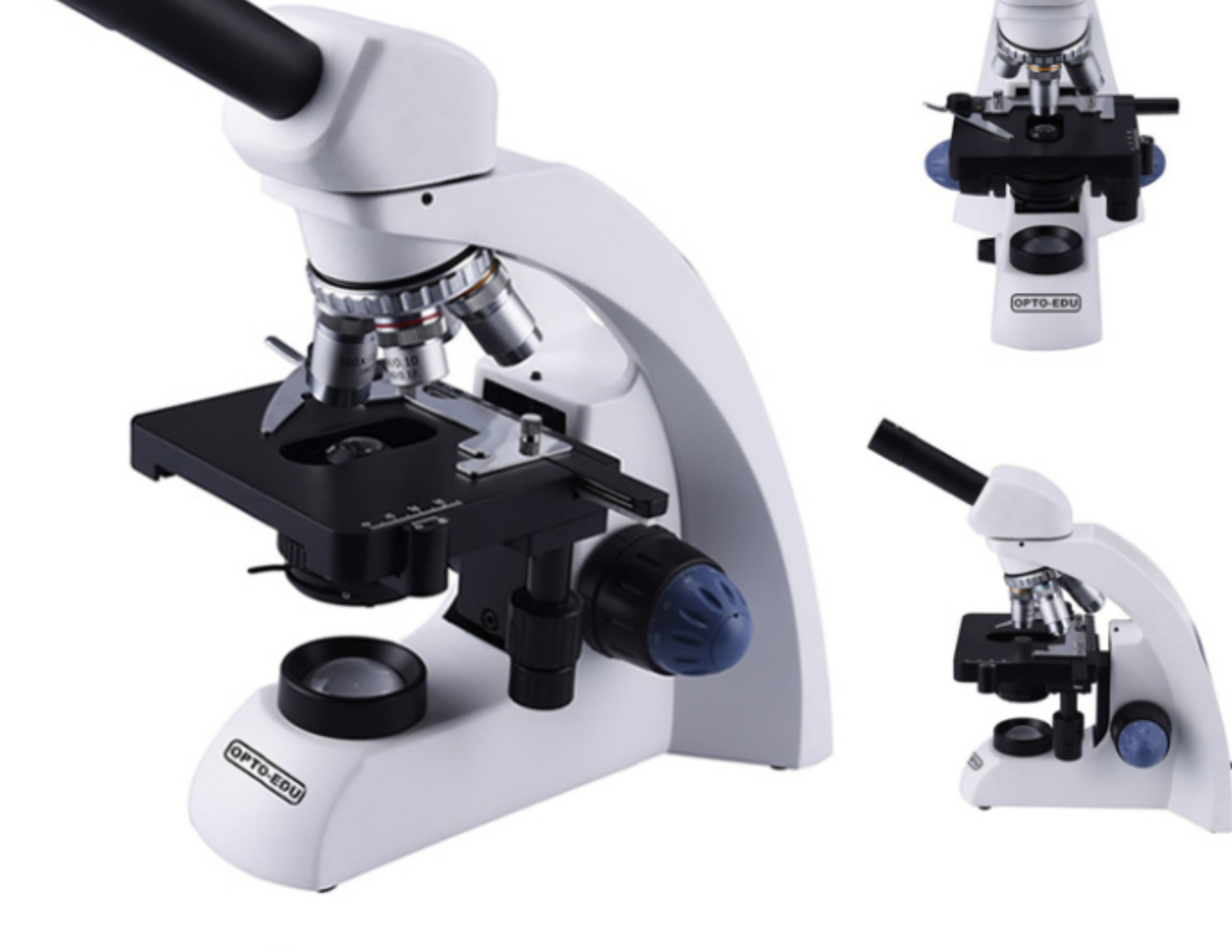
A11.1530-M Monocular Head Biological Microscope