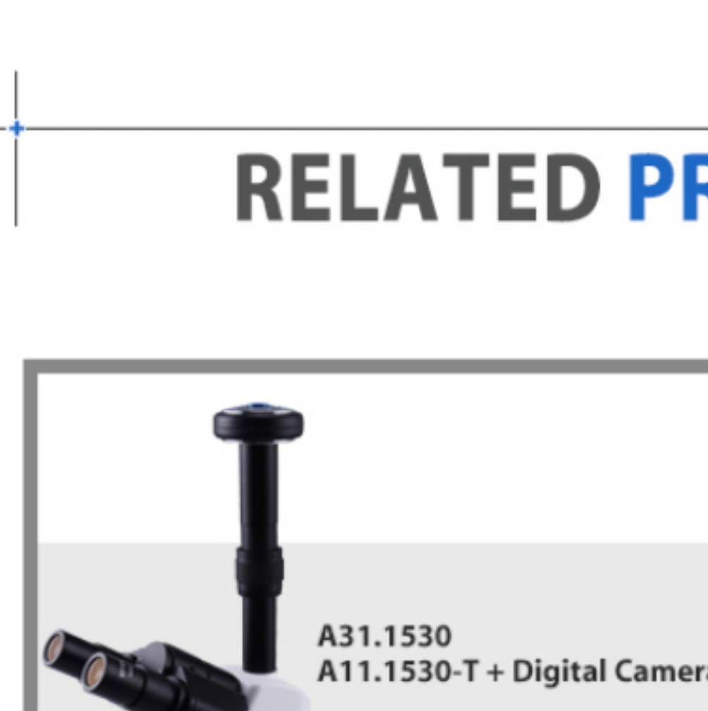
A31.1530 A11.1530-T + Digital Camera