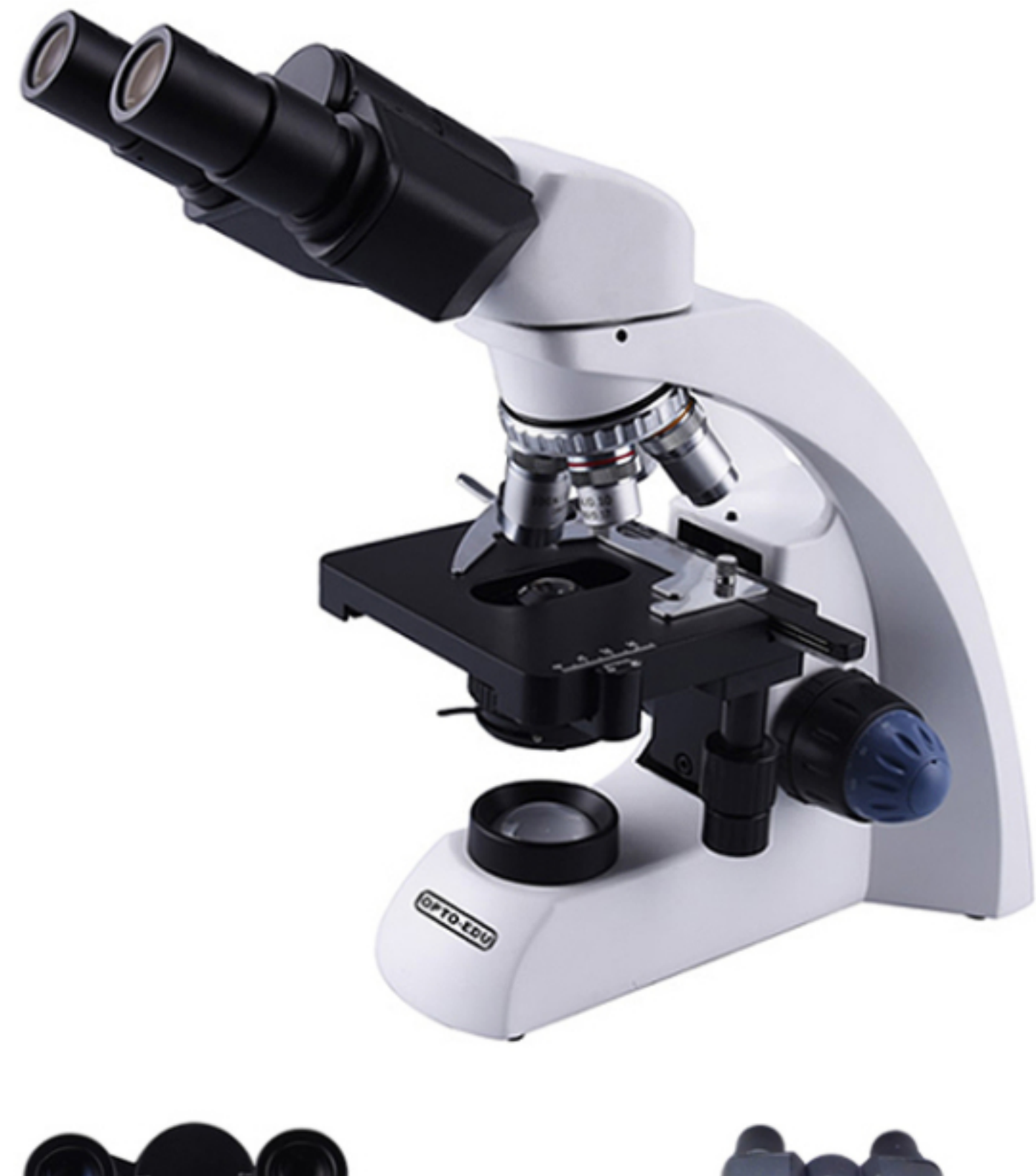
A11.1530-B Binocular Viewing Head Biological Microscope