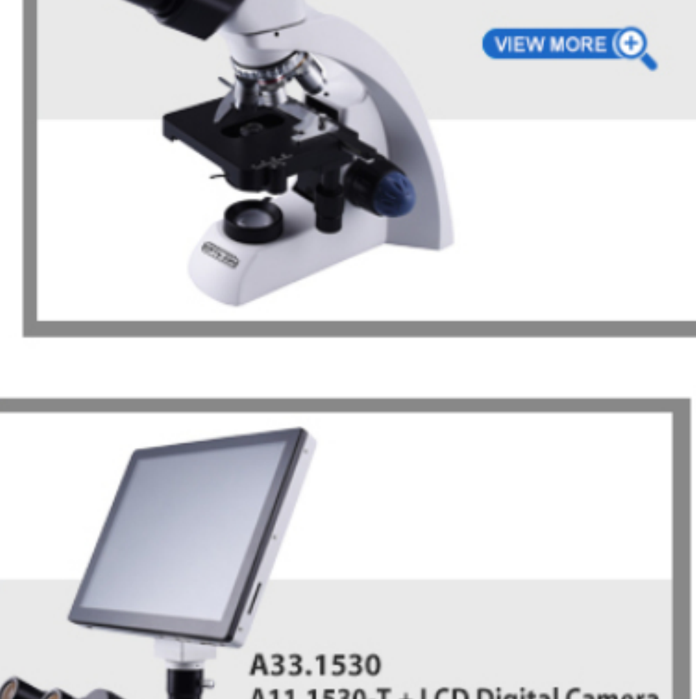
A33.1530 A11.1530-T + LCD Digital Camera