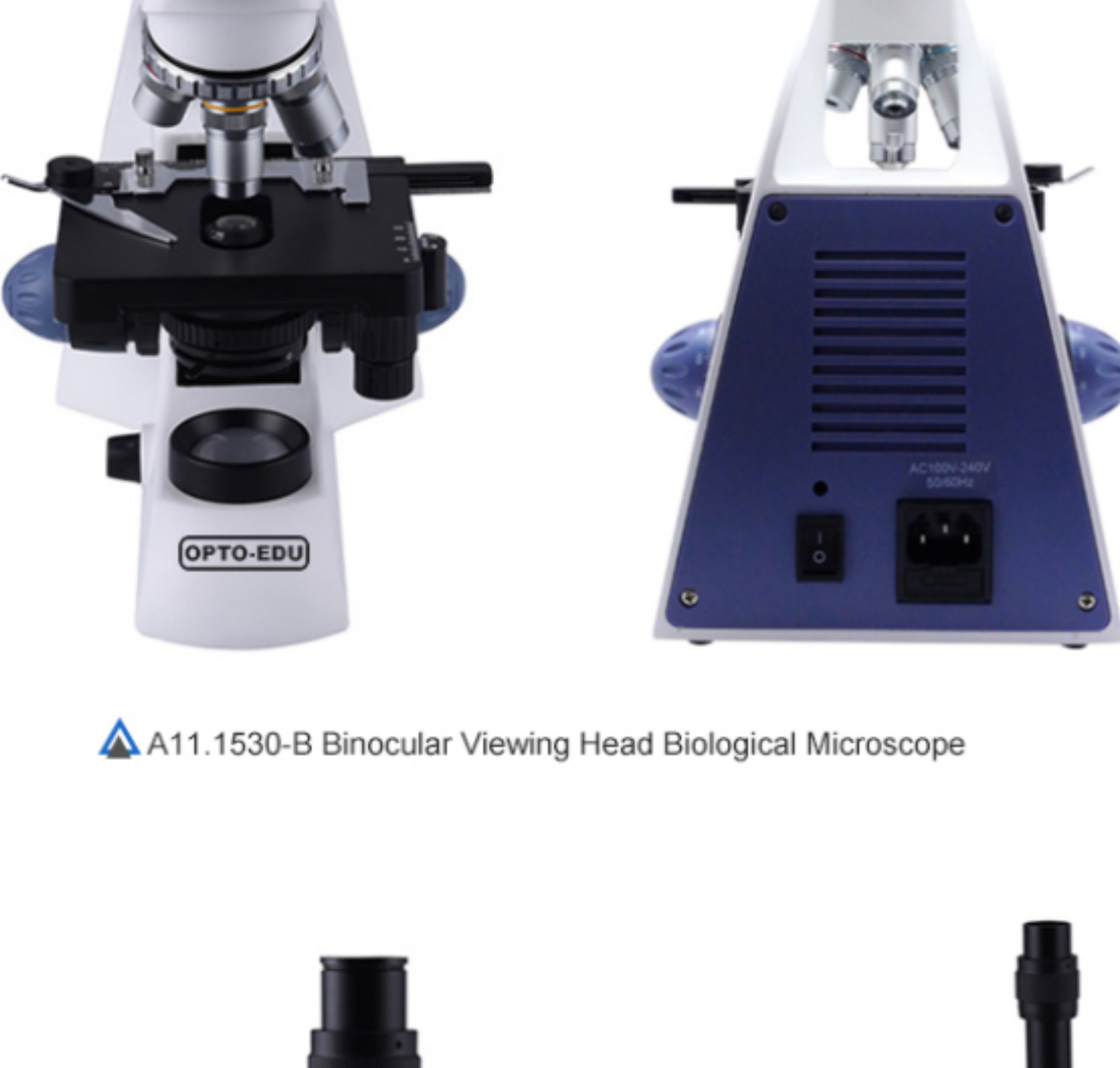
A11.1530-T Trinocular Head Biological Microscope