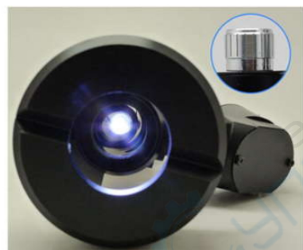
LED Coaxial Illumination, Brightness Adjustable