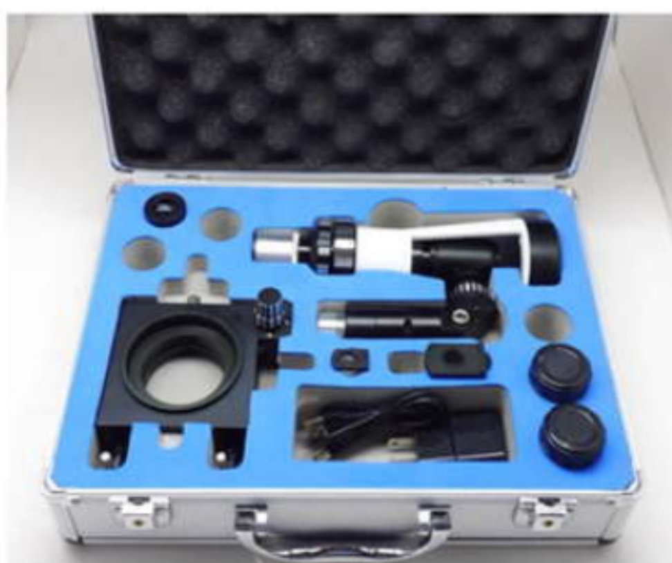
Portable Aluminium Case