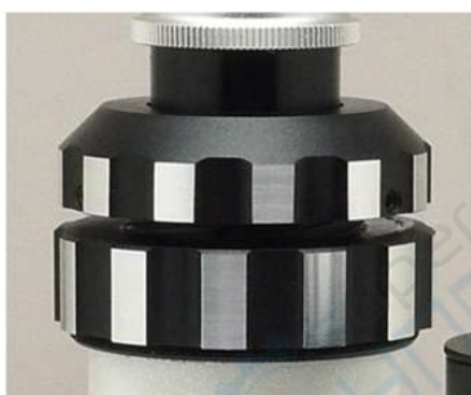
Coaxial Coarse & Fine Focus