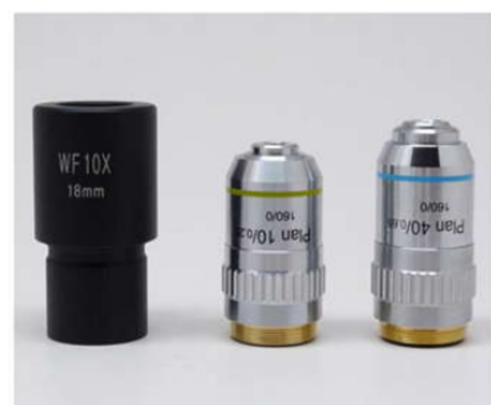
Total Magnification 100-400x