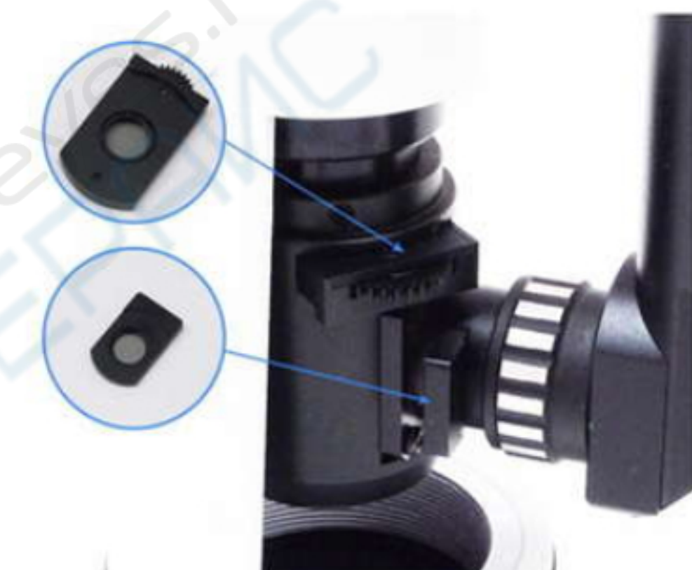
Polarizer & Analyser Slides (Optional)