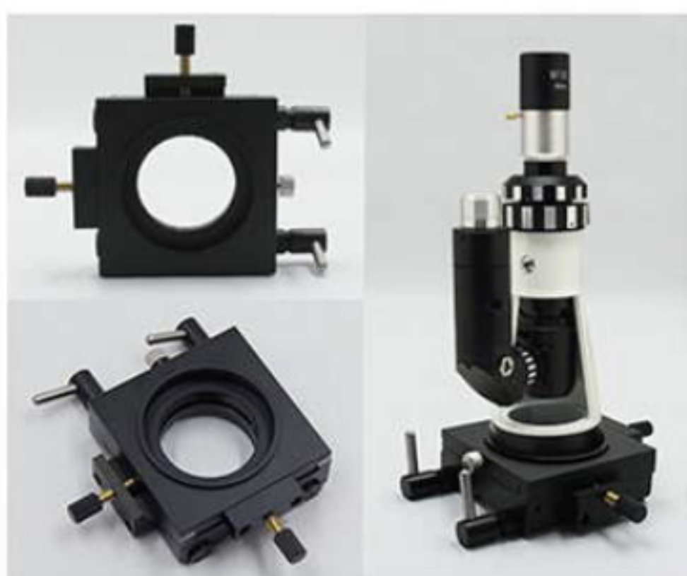
Magnet Stand (Optional)