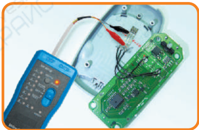
test positive and negative pole of DC electric level

Push DIP switch on emitter to position of “SCAN” , press function switchover button on emitter for 2 seconds, “STATUS” indicator will turn off and “VERIFY” indicator flashes, insert the crystal plug of crocodile clamp into RJ11, clamp the two ends of cable with crocodile clamps, in case that “STATUS” indicator lights up in red , it means the end clamped by red clamp is positive pole, in case that “STATUS” indicator lights up in green, it means the end clamped by red clamp is negative pole, electric level can be judged by brightness of the status indicators; the lighter the indicator, the higher the level is; the darker, the lower.