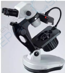
Transmit Illumination 6V/30W Halogen Bulb Built-in Stage, Brightness Adjustable, with Dark Field Device and Bulb Replacement Device